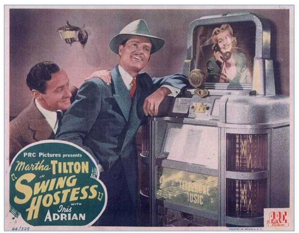
(Jennings Telephone Music)