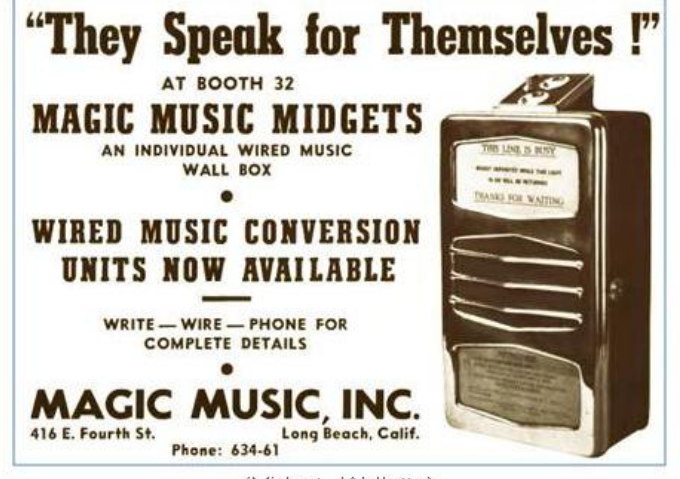
(Midget - Wallette)